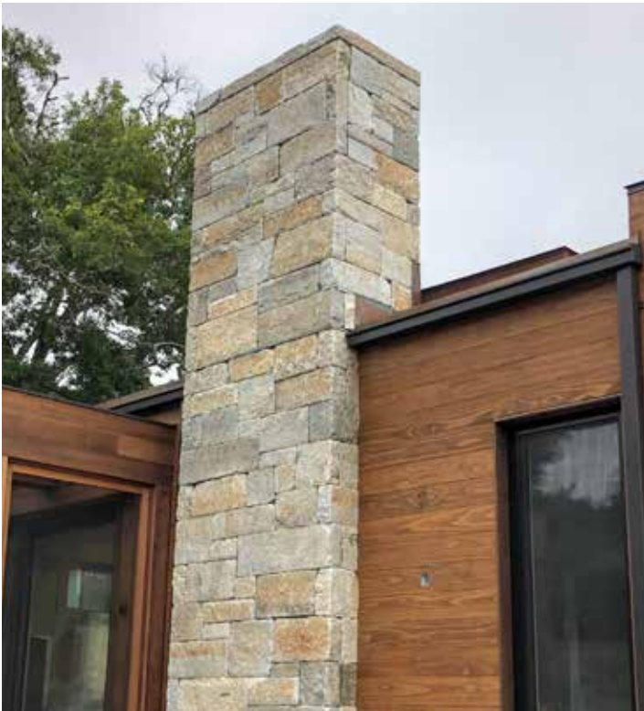
Reclaimed Fullbed Veneer | $650/ton (35 sft/ton)