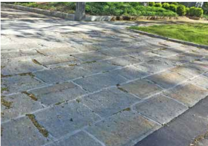
Reclaimed New England Granite Super Jumbo Cobbles | $15/sft