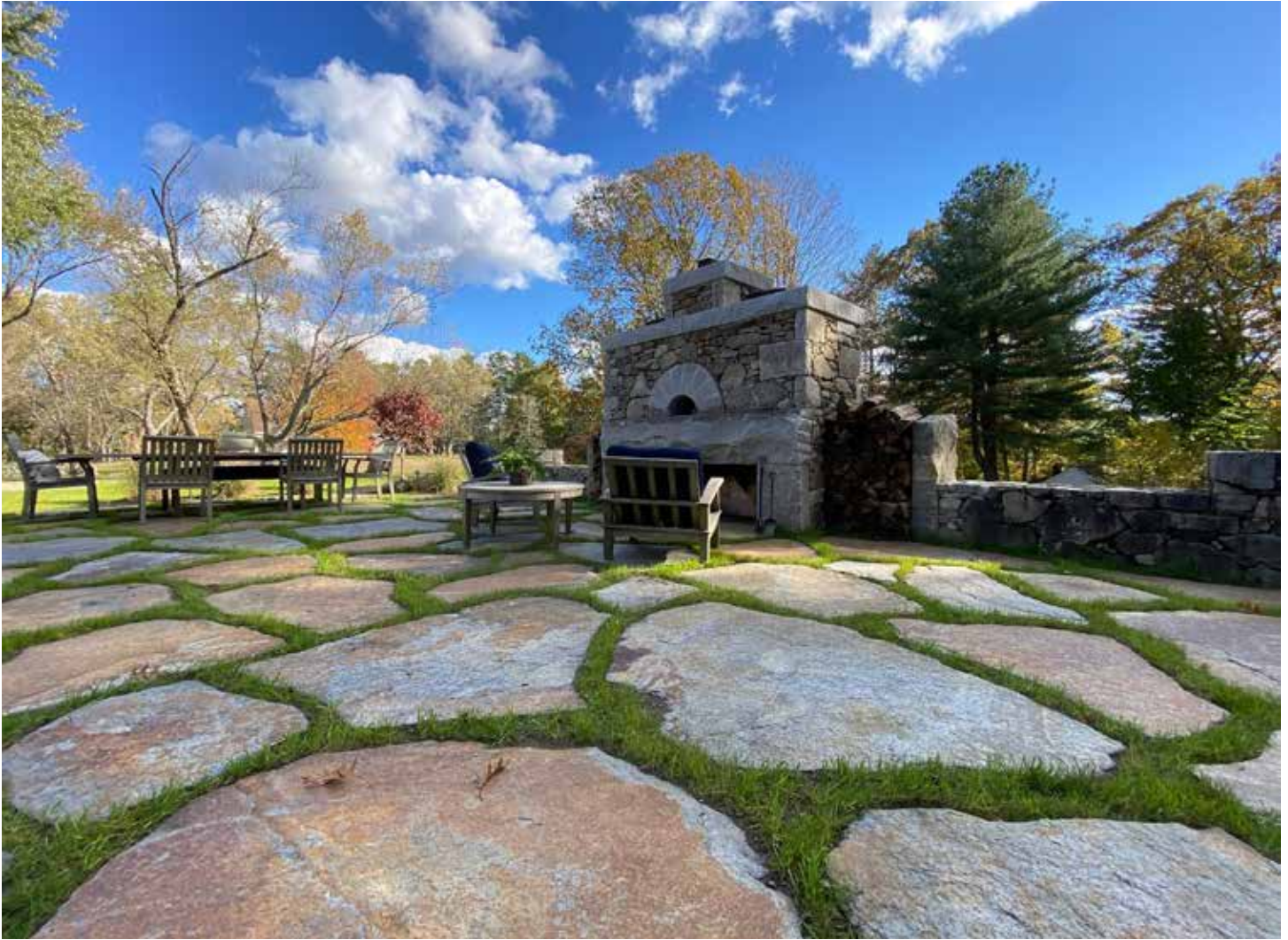
Goshen Stone | $16-20/sft