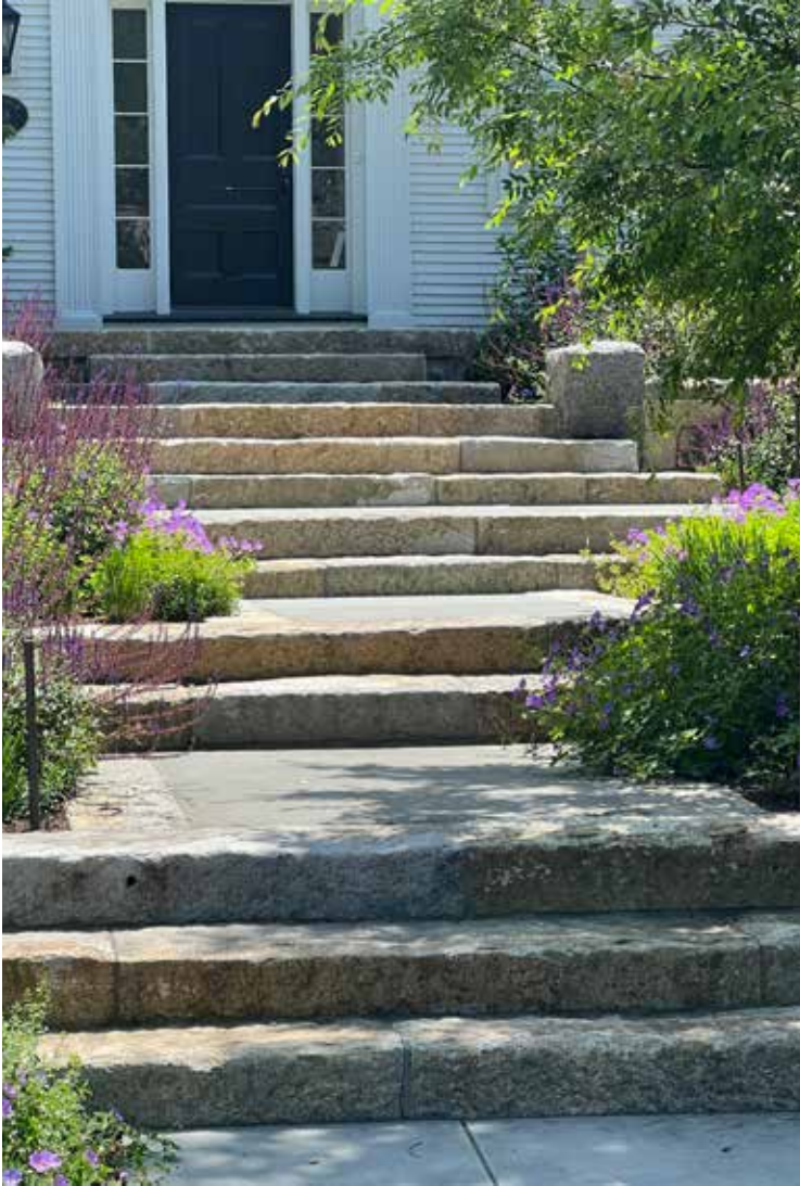
Reclaimed Curbstone (Step Grade) | $95/lf