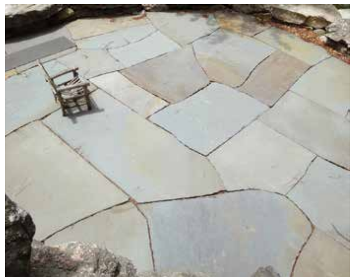
Full Color Natural Cleft Oversized Bluestone | $18-20/sft