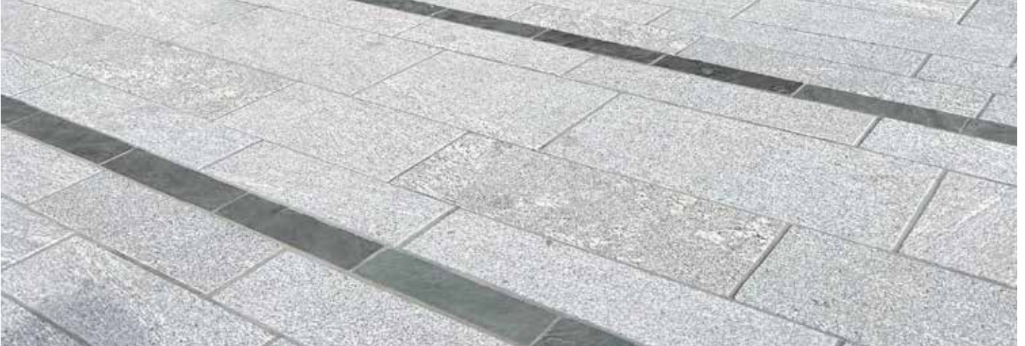
Strata Mist Cross Cut Gneiss | $18/sft