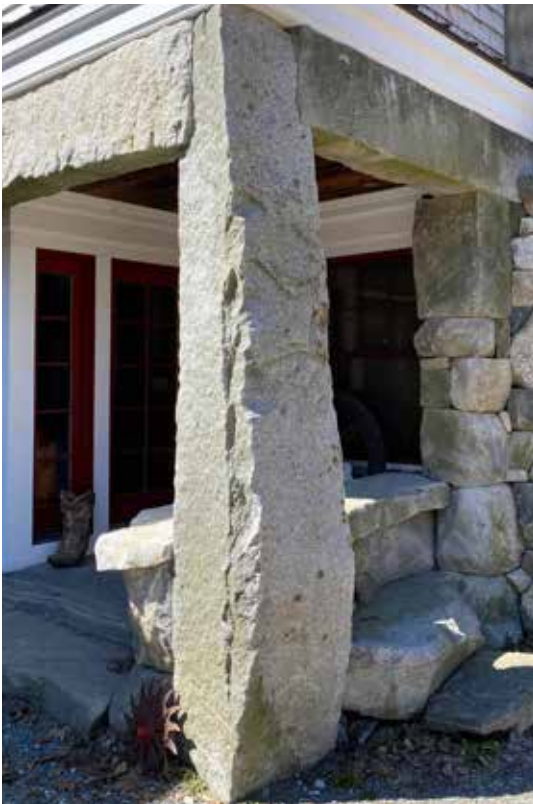
Reclaimed Columns | $175/lf