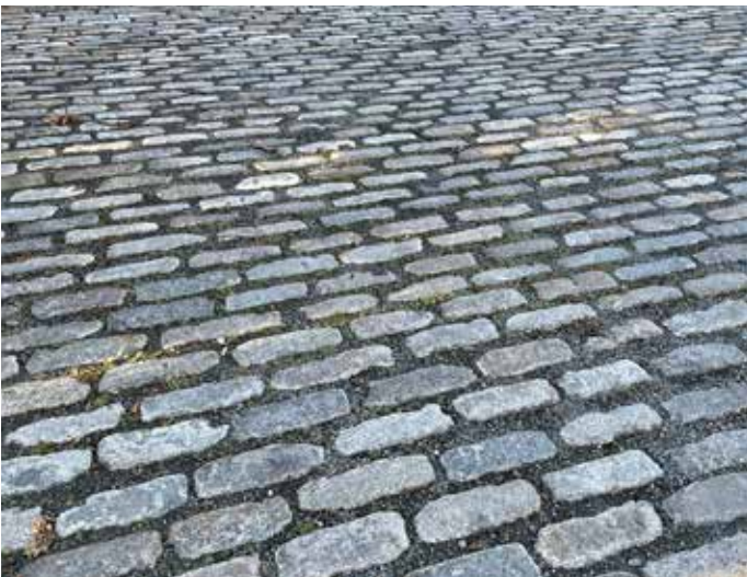
Reclaimed New England Granite Jumbo Cobbles | $900/pal