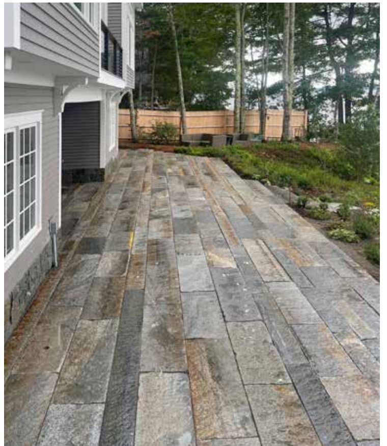
New England Third Generation Plank Pavers | $45/sft