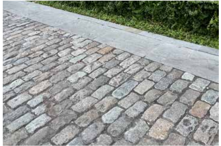
Reclaimed Porphyry Cobbles | $1,170/ton (~55 sft/ton)