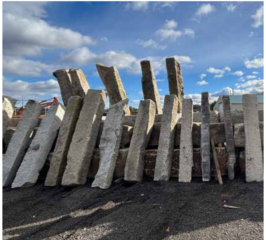
Reclaimed Posts | $125/lf