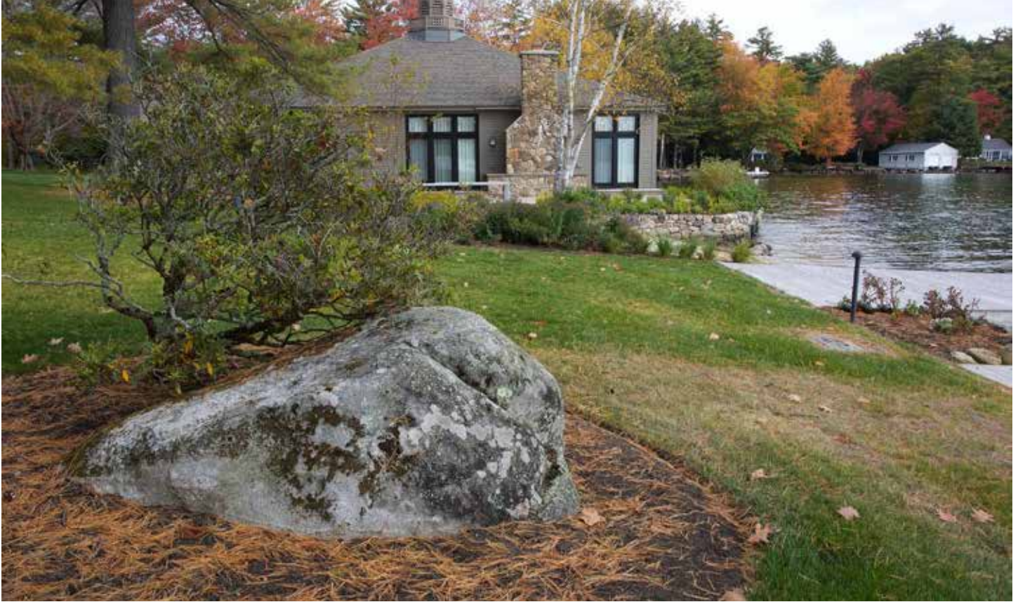
Boulders | $350/ton