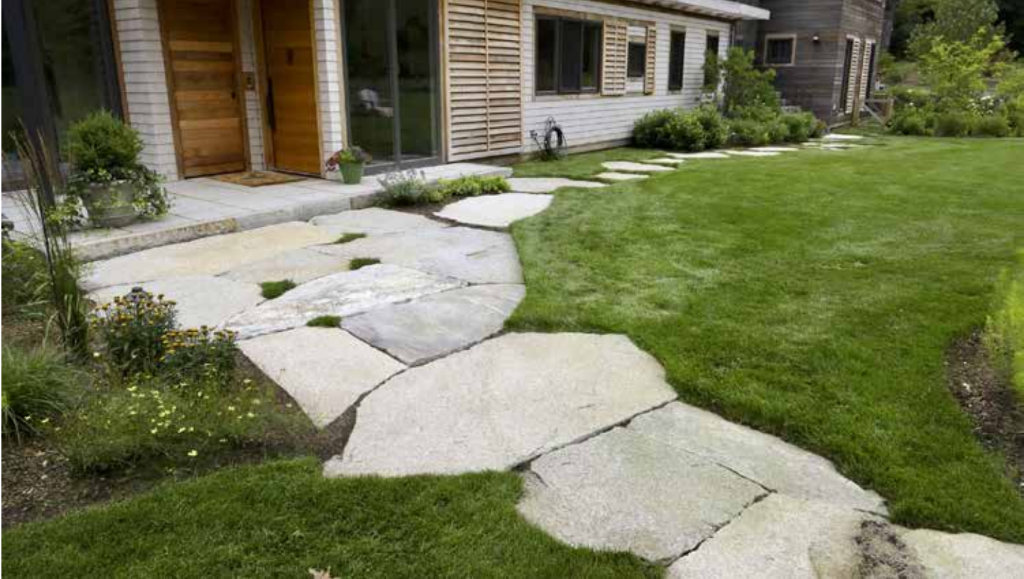
Dodlin Hill Granite | $35/sft