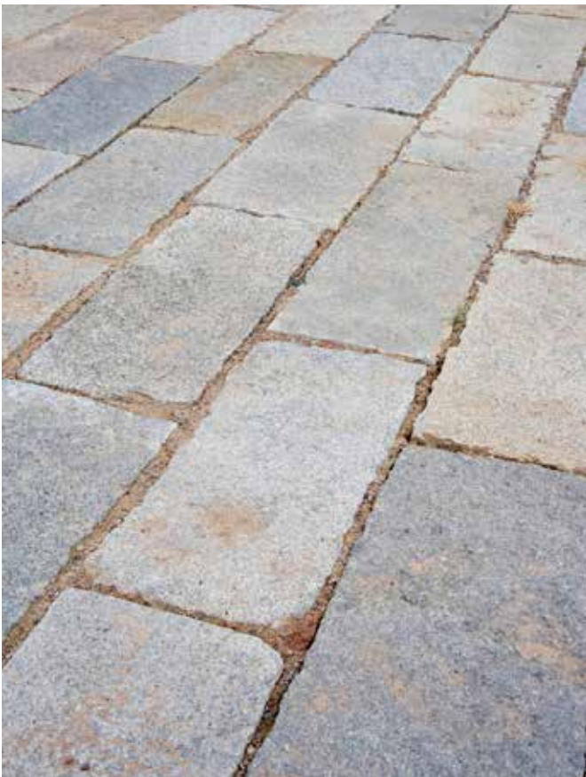
Reclaimed Rustic Granite Planks 18 x 36" | $35/sft