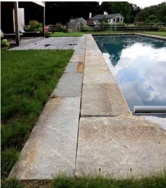
Reclaimed Pool Coping | $95/sft