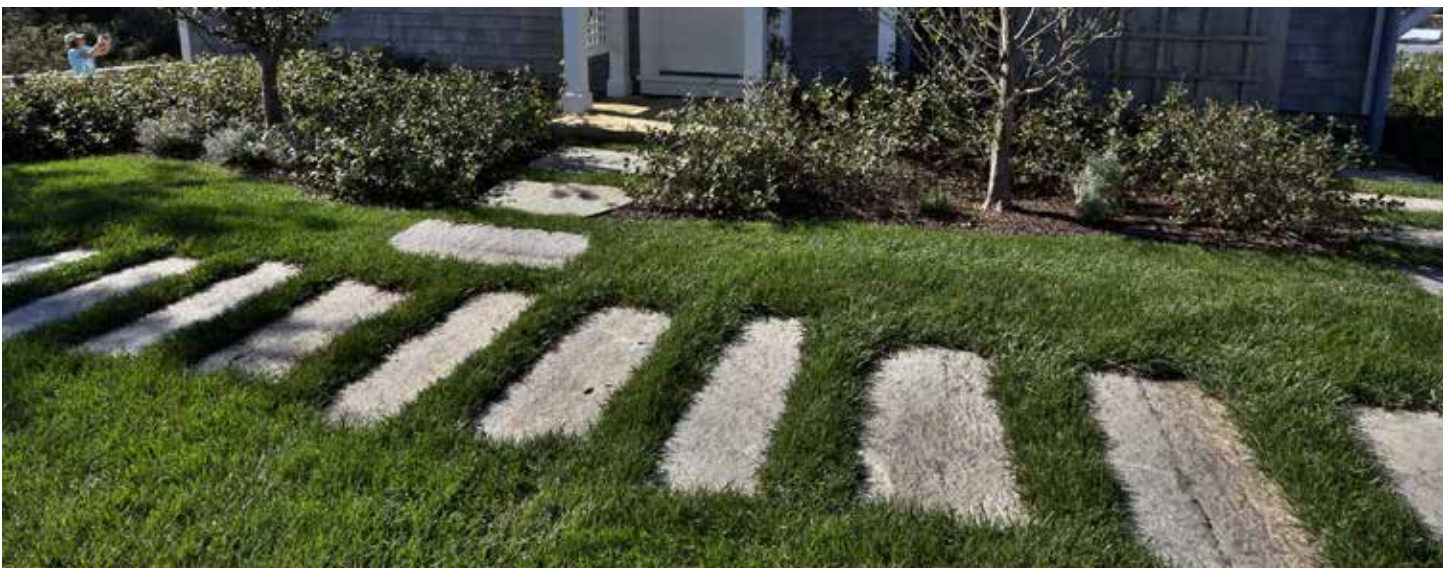
Reclaimed First Generation Steppers | $40/sft