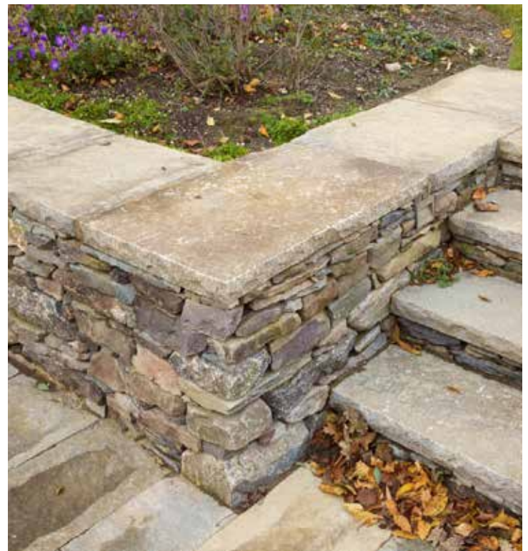
Reclaimed Wall Caps | $95/sft