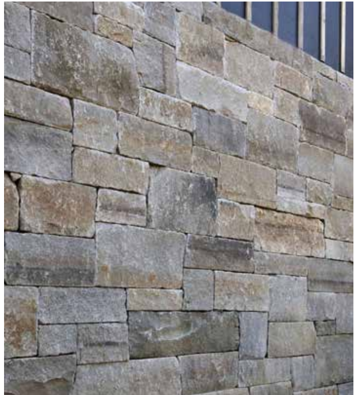
Reclaimed Fullbed Veneer | $650/ton (35 sft/ton)