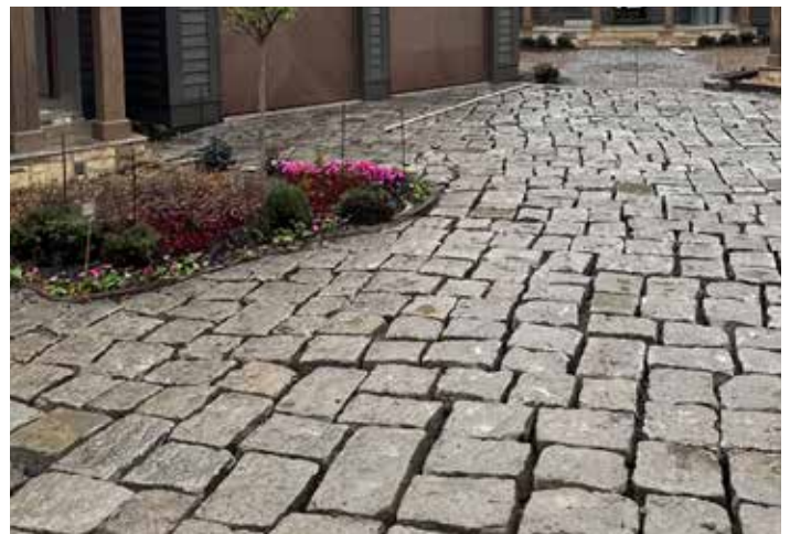
Reclaimed Bridge Squares | $15/sft