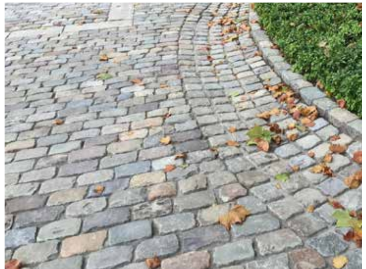
Reclaimed European Sandstone Cobbles | $1,170/ton (~$55 sft/ton)