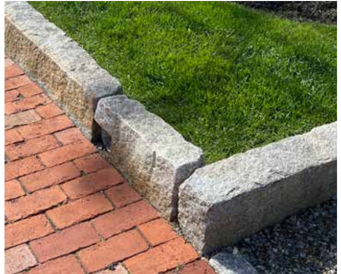
Reclaimed Junior Edging | $35/lf