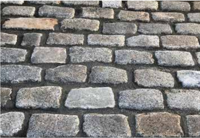
Reclaimed New England Medium Cobbles | $750/pal (~32 sft/pal skinny side up, ~42 sft/pal broad side up)