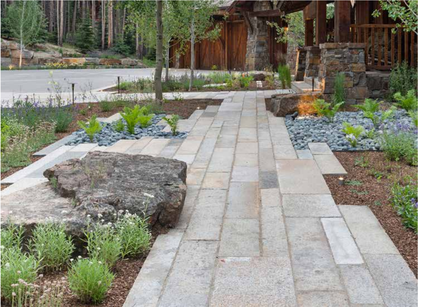
Reclaimed Footworn Plank Pavers | $35/sft