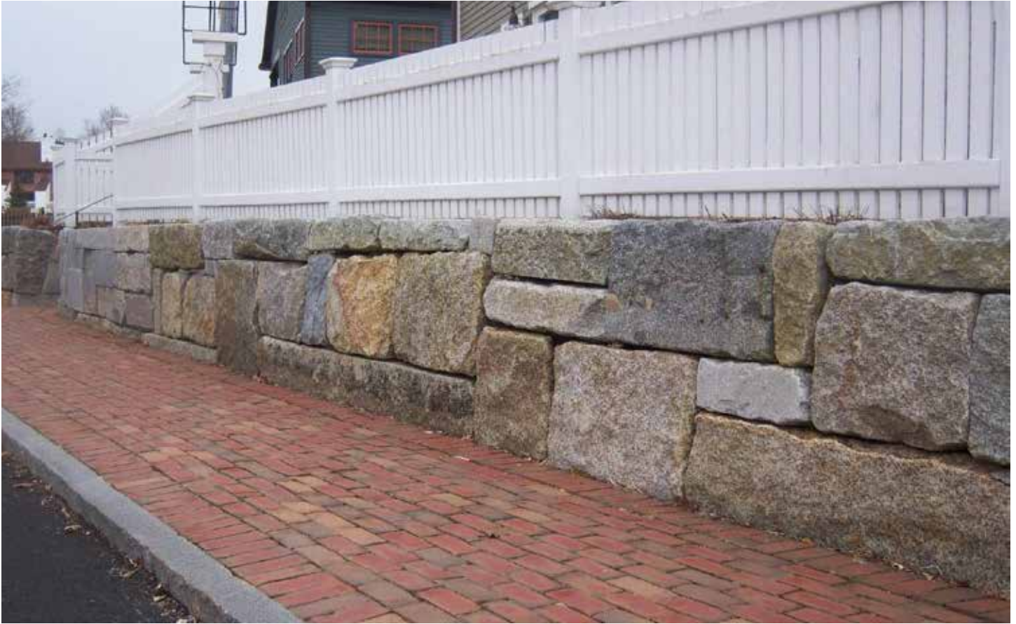
Reclaimed Granite Block Mix Wallstone | $350/ton