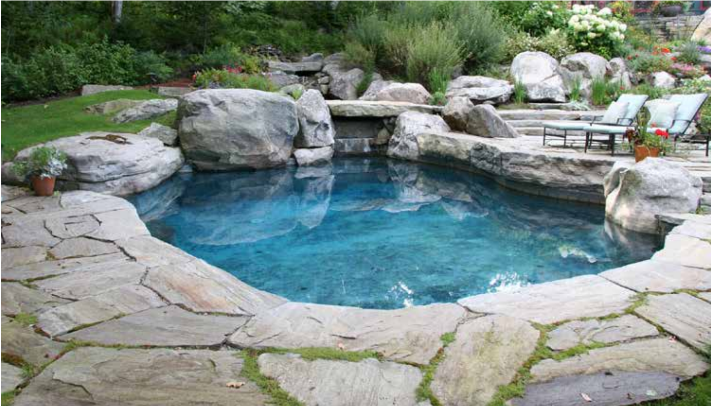
Mystic Mountain | $38/sft