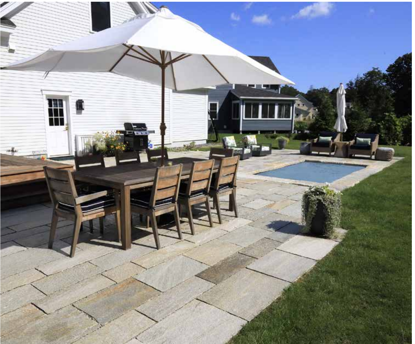
Pietra Italia Gneiss | $23/sft