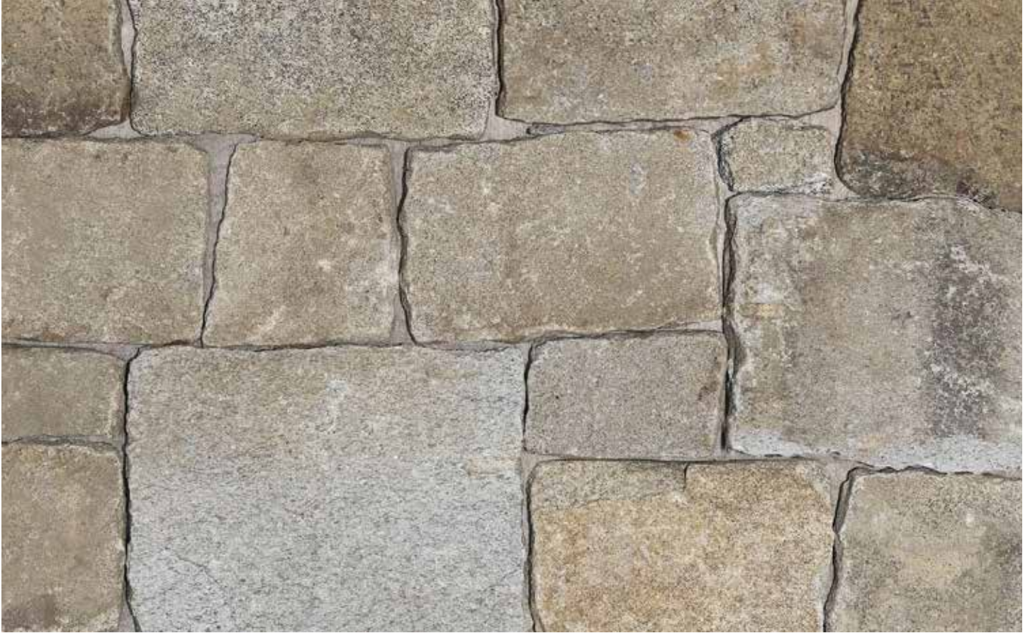
Reclaimed Thin Veneer | $25/sft