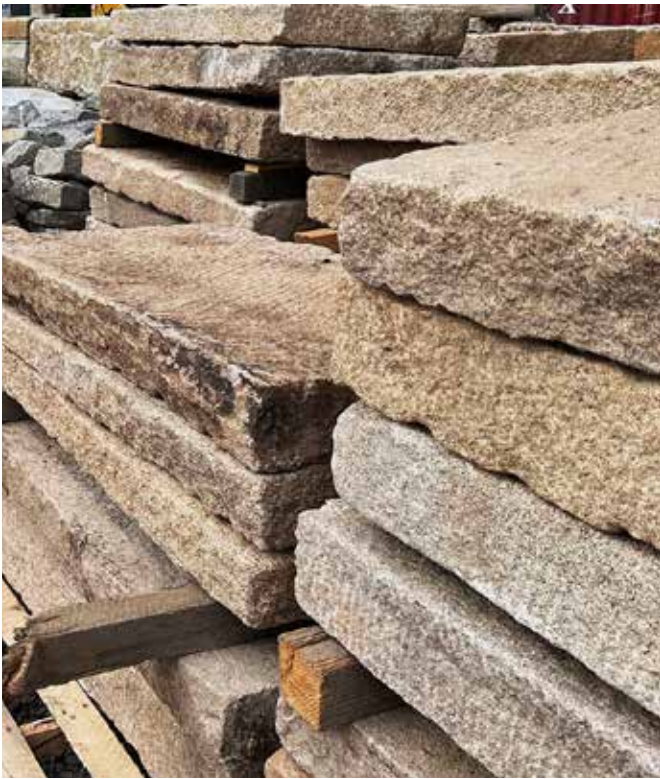
Reclaimed Rustic Granite Planks 24 x 48" | $35/sft