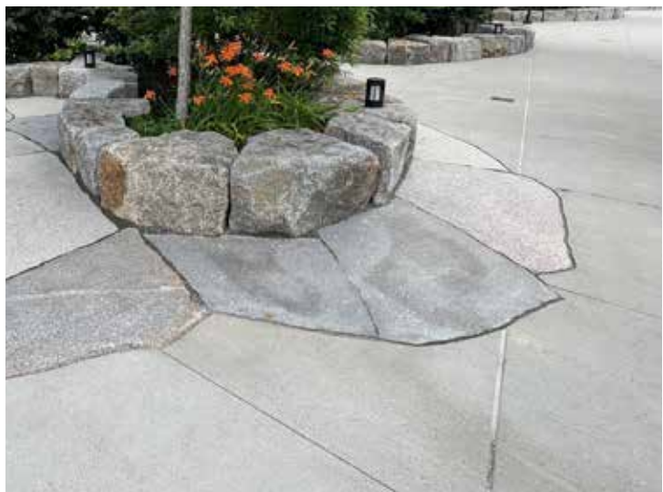
New England Granite Mix | $42/sft thermal top, live edge