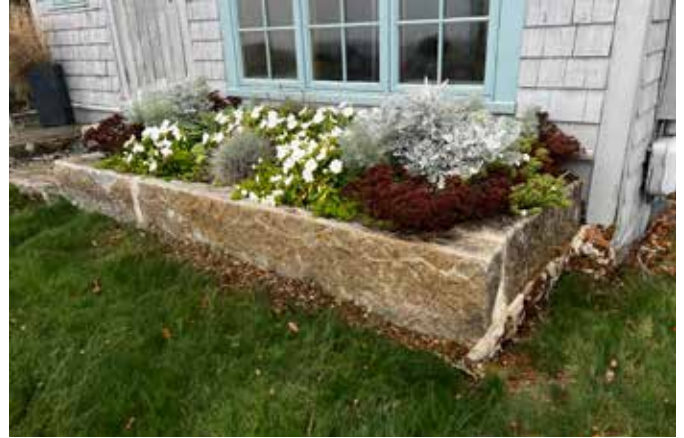
Reclaimed First Generation Edging | $35/lf