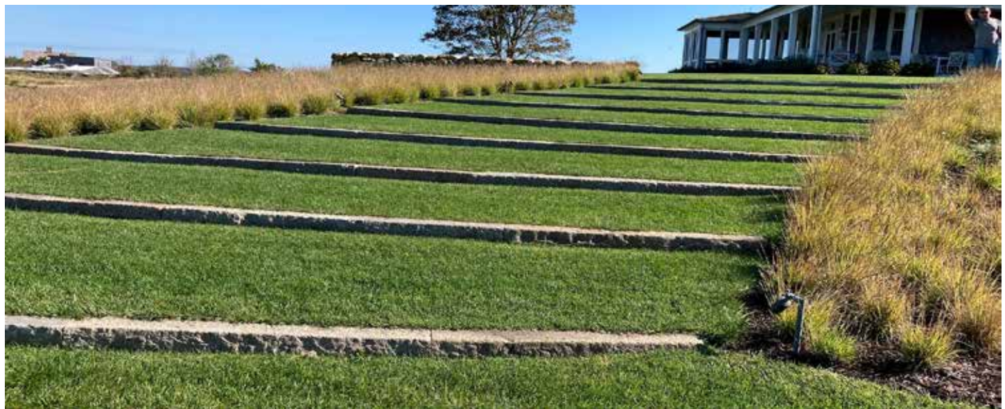
Reclaimed Lawn Steps | $55/lf